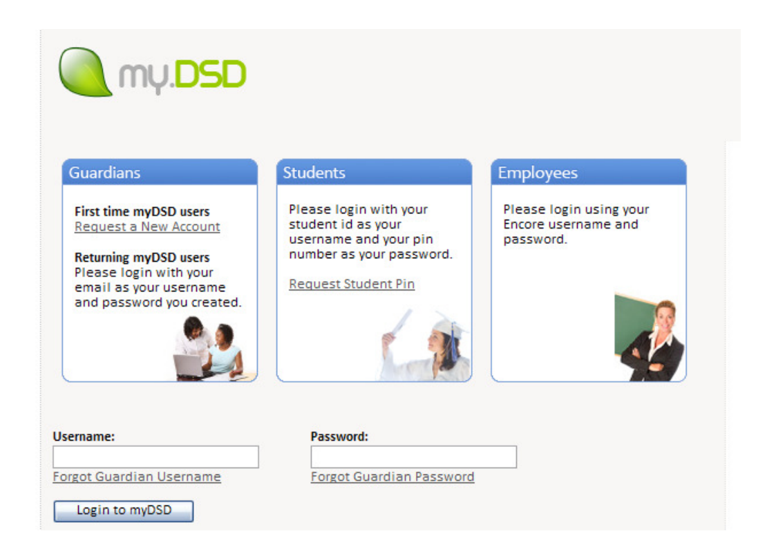
Step 1: Type in your student's ID

Click on Request a New Account in the Guardians box.